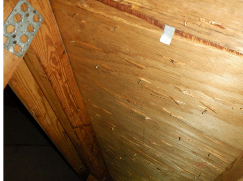
7/16" Deck Thickness Confirmed