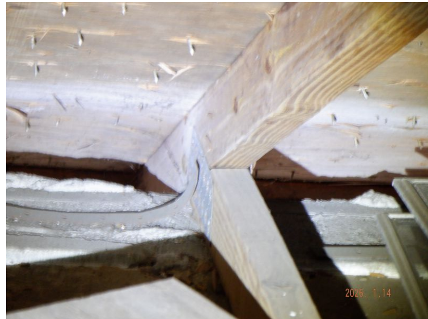
Opposing side of Truss