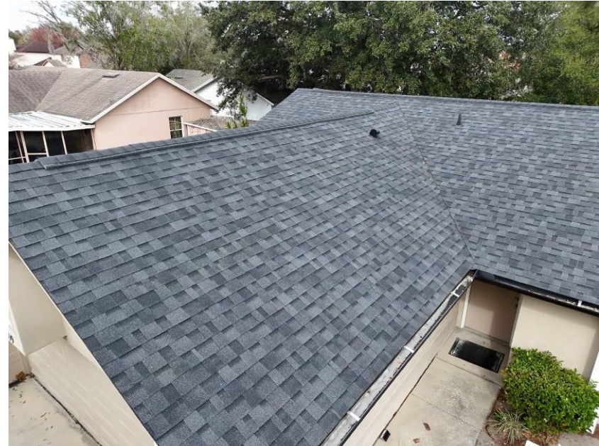
Architectural/Dimensional Shingle Roof Covering