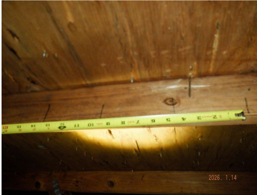
8d Nails or Greater in Size Spaced 6" in the Field