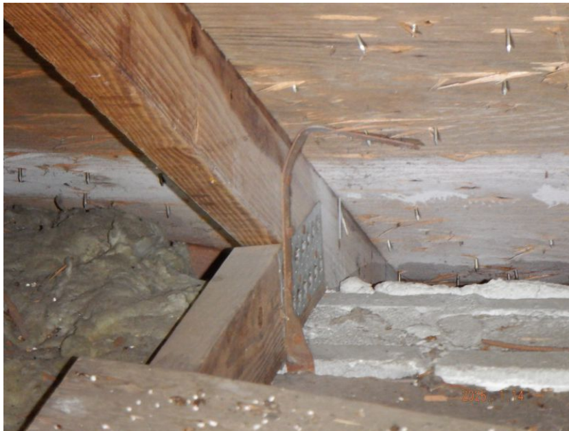
Metal Connector with 3 Nails