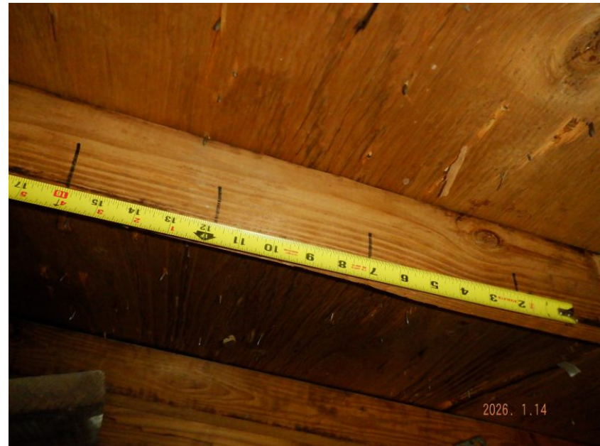
8d Nails or Greater in Size Spaced 6" Along the Edge